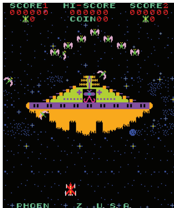
Figure 3 Boss Level in Phoenix